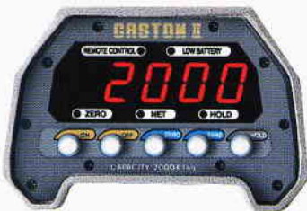
▲ Display & Key board