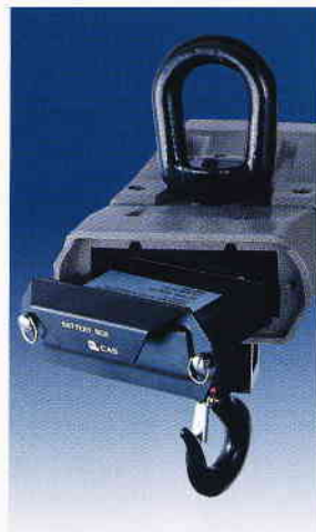
▶ Battery Pack Installation